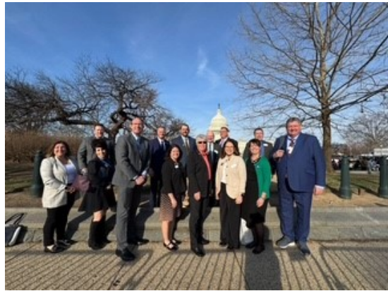
The PA Principals Association leaders in front of the U.S. Capitol.