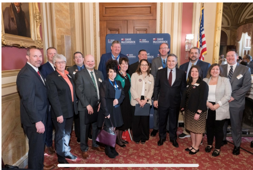
The PA Principals Association group with U.S. Sen. Dave McCormick.