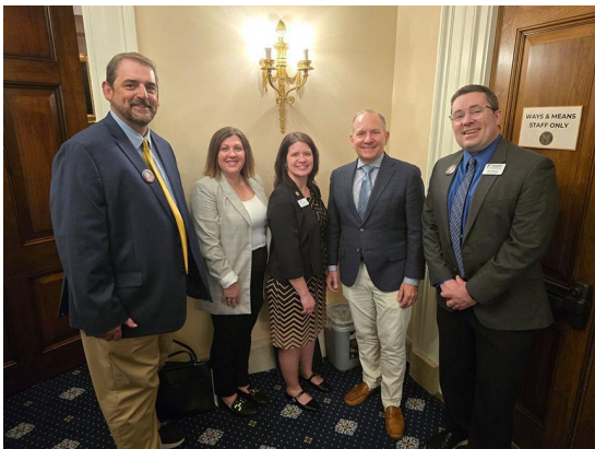
The Central Region group with U.S. Rep. Lloyd Schmucker.