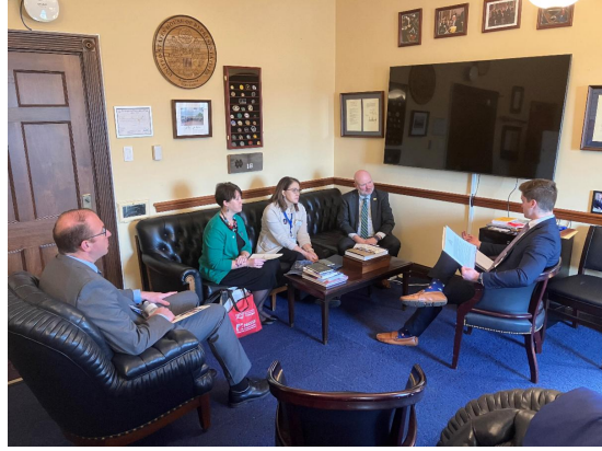
The West Region group met with U.S. Rep. Chris Deluzio.