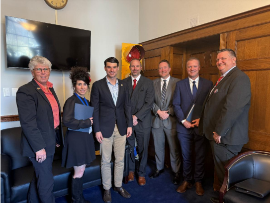
The East Region group with U.S. Rep. Rob Bresnahan.