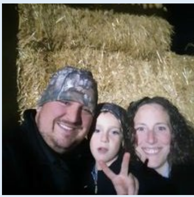
Dedicated Husband, Father, Principal, and PA Principal's Board Member.

Throughout the last 8 years, I had the pleasure of serving the members of our Pennsylvania Principals Association as West II Region as Secondary Regional Representative , now, State Director . In addition to this responsibility, I also served the association as a member of the conference committee , a consistent contributor of the PA Administrator and a presenter at our LEAD Conferences . Throughout this time, I was also appointed to serve as a member of the Pennsylvania Department of Education's School Improvement Advisory Committee . In addition, I also served my local school district and community as a School Board Member for a 4-year term.