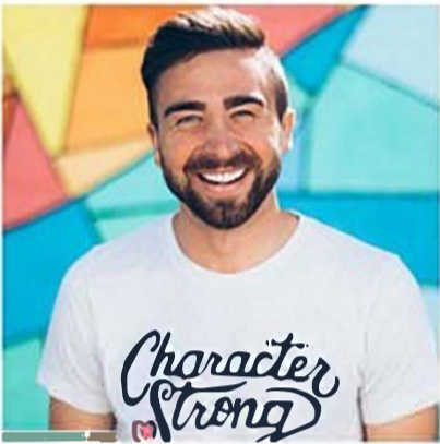
HOUSTON KRAFT CHARACTER STRONG