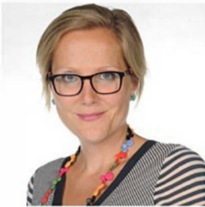
TESS CHARNAUD INTERNATIONAL SCHOOL OF LUXEMBOURG